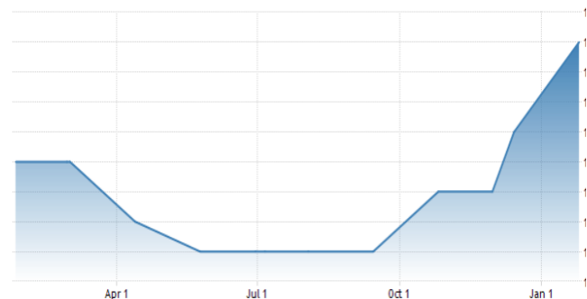
UKRAINE INTEREST RATE